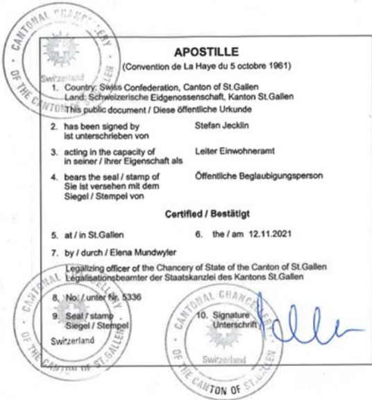
(Legalized by Korean Embassy)